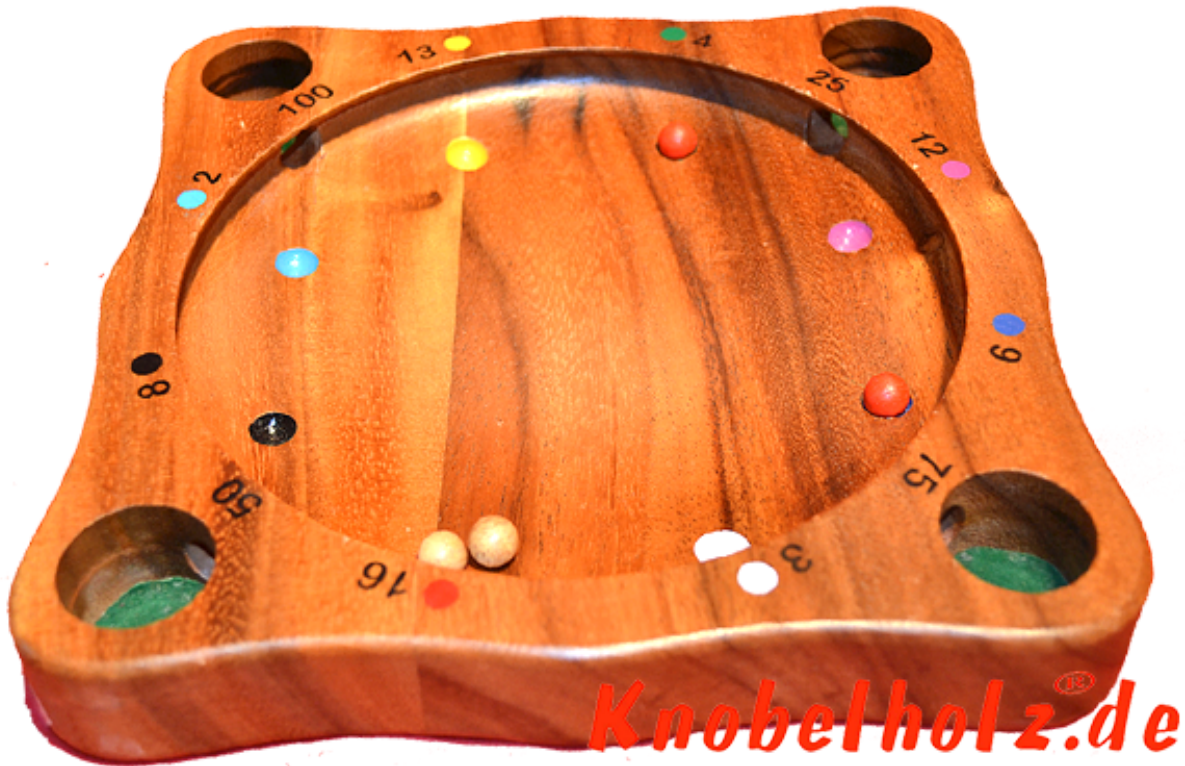
Tiroler Roulette das Kreisspiel, ein Unterhaltungsspiel mit Maßen 19,5 x 19,5 x 3,5 cm, Twister Roulette samanea wooden game